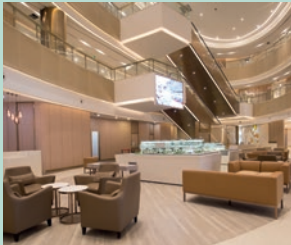
Perennial International Specialist Medical Centre