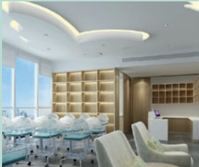
AND Maternal and Child Health Centre