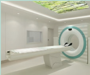
BGI Perennial Genomics Diagnostic Imaging Centre